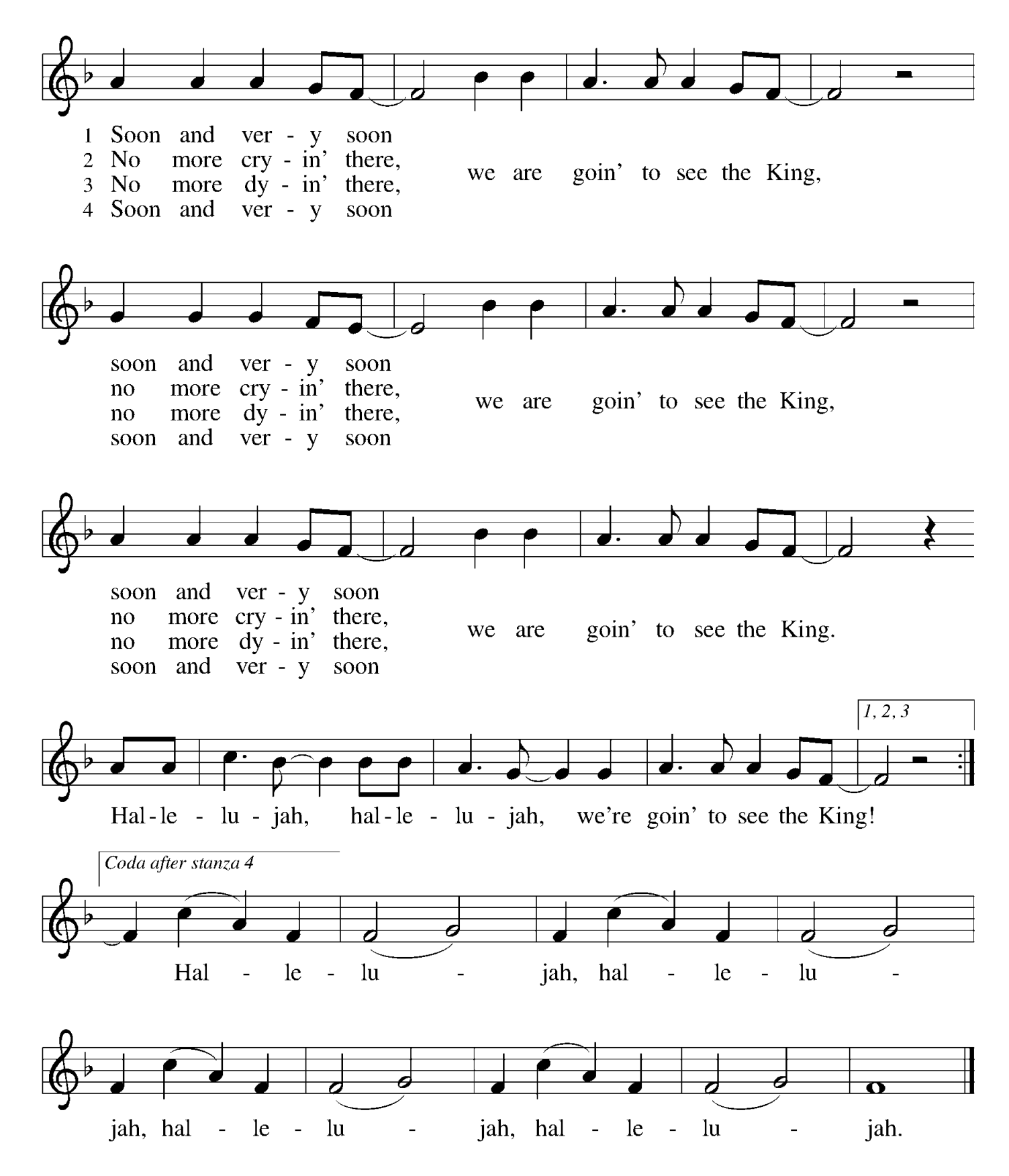
HymnSoon and Very SoonELW 439